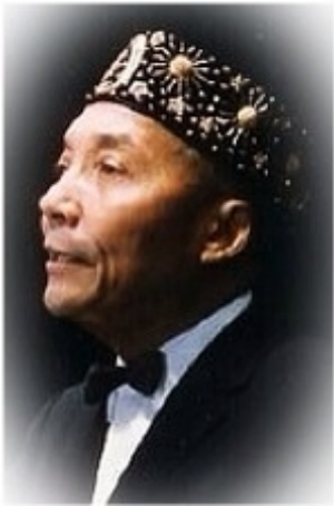
The Most Honorable Elijah Muhammad

From Message to the Blackman in America, Chapter 78 — (This text is a direct transcript of the original published work, reproduced without alteration, without any grammatical or typographical errors present in the source)