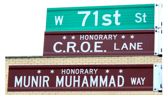
Honorary street signs at 2435 W. 71st Street, Chicago