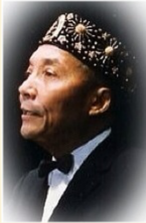
The Most Honorable Elijah Muhammad

By the Most Honorable Elijah Muhammad — July 3, 1966 · (This text is a direct transcript of the original published article, reproduced without alteration, without any grammatical or typographical errors present in the source)